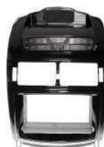
FP9650PK (Piano Black)