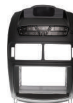
FP9650SK (Satin Black)